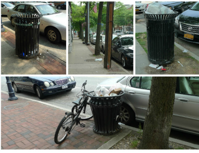
Examples of Oyster Bay's Garbage Problem