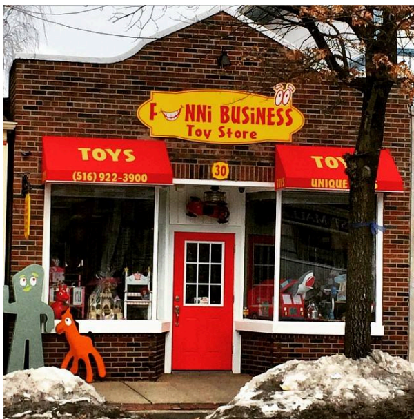
Funni Business, 30 Audrey Avenue 2015 Grant Recipient

OBMSA began this small, privately-funded grant as a means to help business and building owners in the downtown with small improvements, while keeping true to our design guidelines. Since 2013, we have invested over $20,000 into the downtown, assisting 13 new and existing businesses.