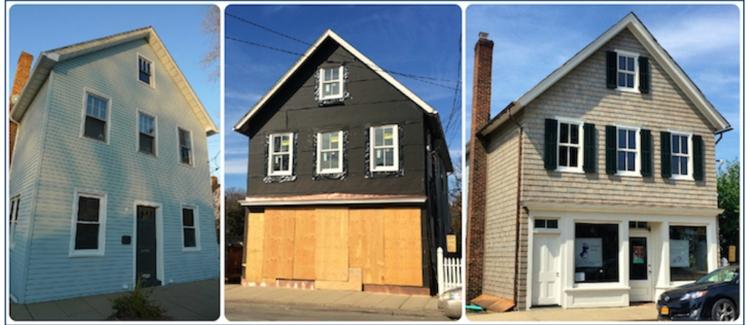
30 West Main Street, Oyster Bay, NY Recipient of OBMSA's 2011 New York Main Street Grant