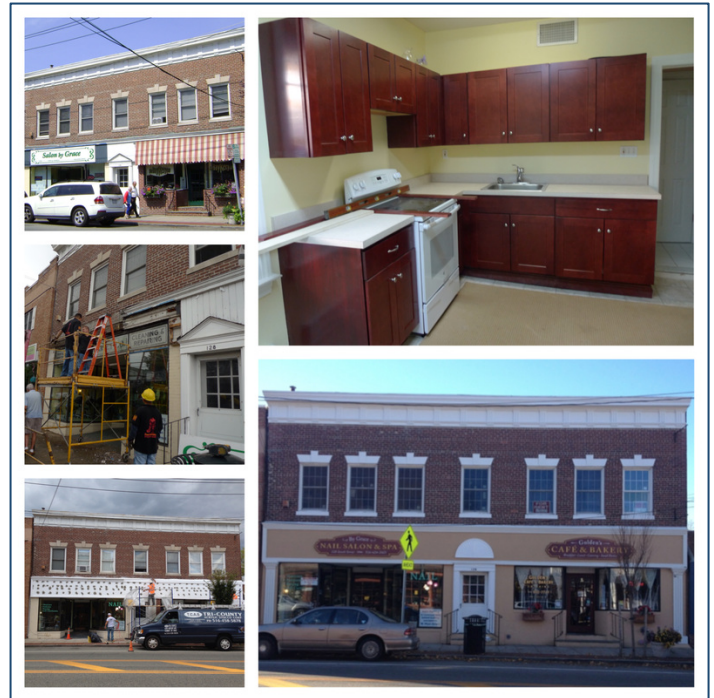
2 Existing Businesses/ 4 Residential Units: (Salon By Grace/Gulden's Café) 124-128 South St