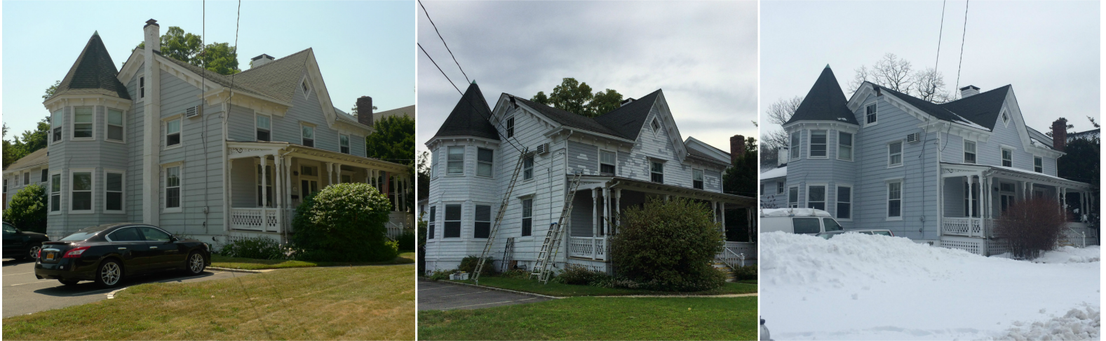
Historic Property: 193 South Street