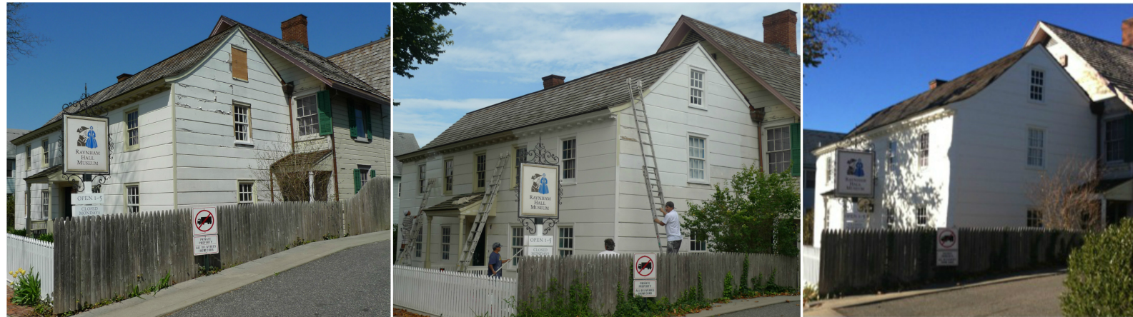
Historic Property: Raynham Hall Museum, 20 West Main Street