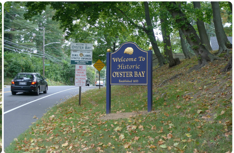
Before and After photos of Cove Road "Spot" adopted by Mill-Max Mfg. Corp.

Complete plantings and the installation of a sprinkler system for the location will be completed in the Spring.