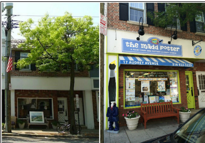
New Business: The Madd Potter of Oyster Bay 17 Audrey Avenue