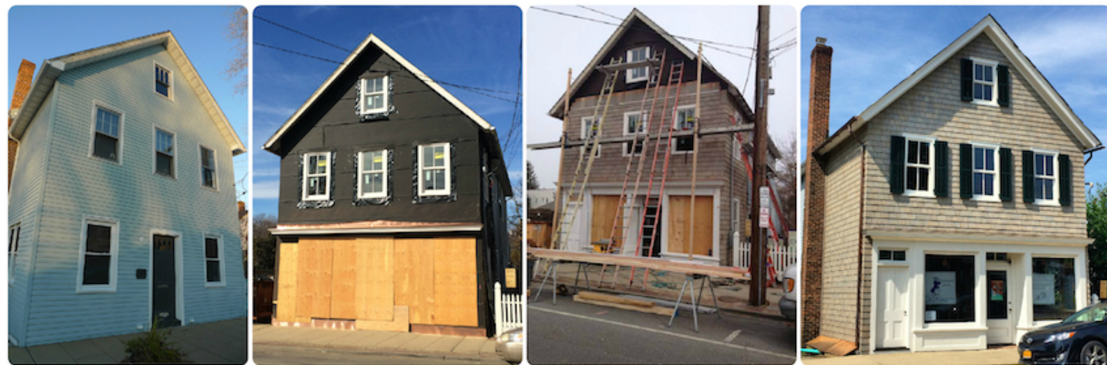
Historic Property: Lincoln Market, 30 West Main Street