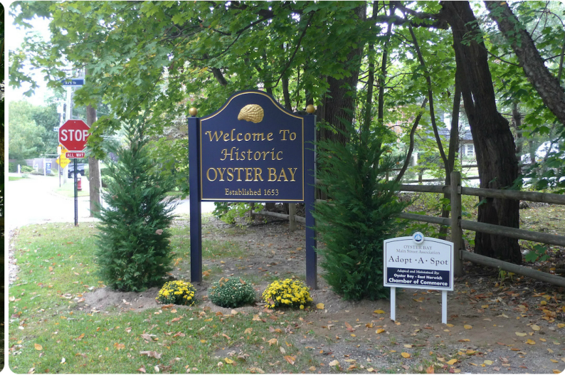
Before and after photos of the Berry Hill "Spot" adopted by the Oyster Bay-East Norwich Chamber of Commerce.

These sites, which had largely been ignored over the years, were a high priority for the Main Street Association. On Cove Road and Berry Hill Road, the hand-carved "Welcome to Historic Oyster Bay" signs had both disappeared and been replaced with unsightly aluminum signs that did not match the tenor of the downtown. With their adoption, the Chamber of Commerce and Mill-Max both purchased new welcome signs for their locations as well as new plantings, which will be maintained for two years by the adopters. The Cove Road location is slated to have a sprinkler system installed with new plantings in the Spring.