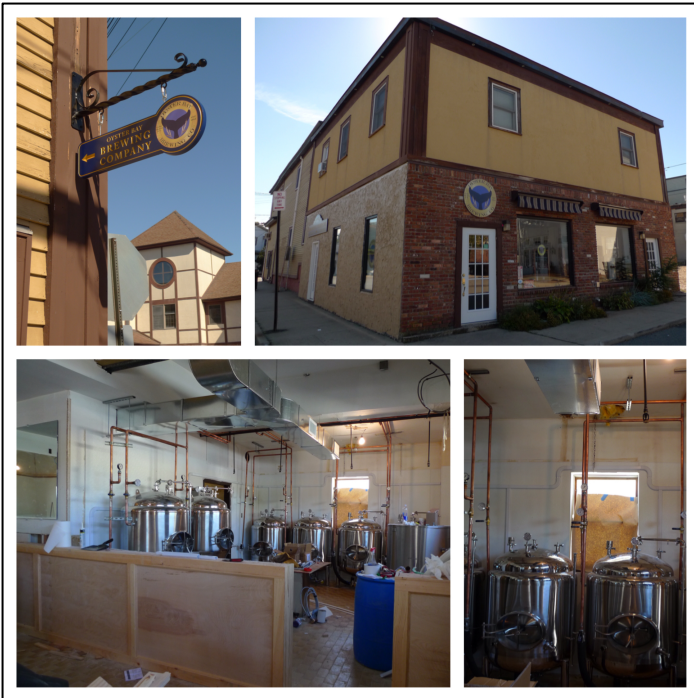
New Business: Oyster Bay Brewing Company, 76 South St