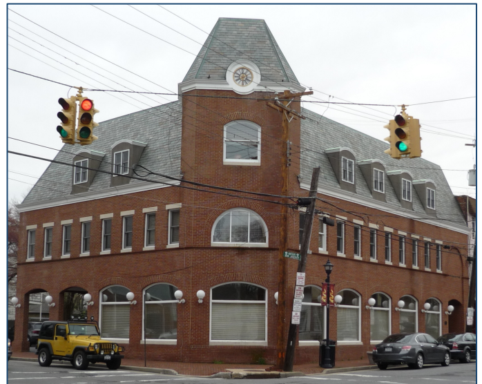
Existing Business: Travelsavers, 71 Audrey Avenue